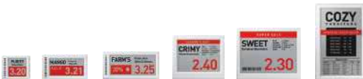
ESL COLOR LINEUP