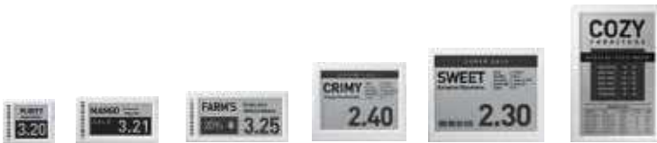
ESL B&W LINEUP

Capacitive Touch (Optional) Embedded Wifi Module